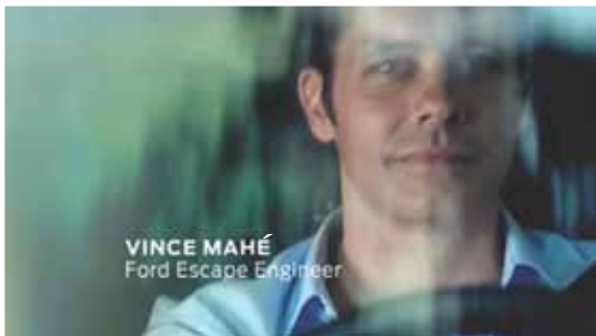
Video frame